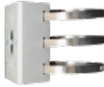
XLGUP06 Pole Mount